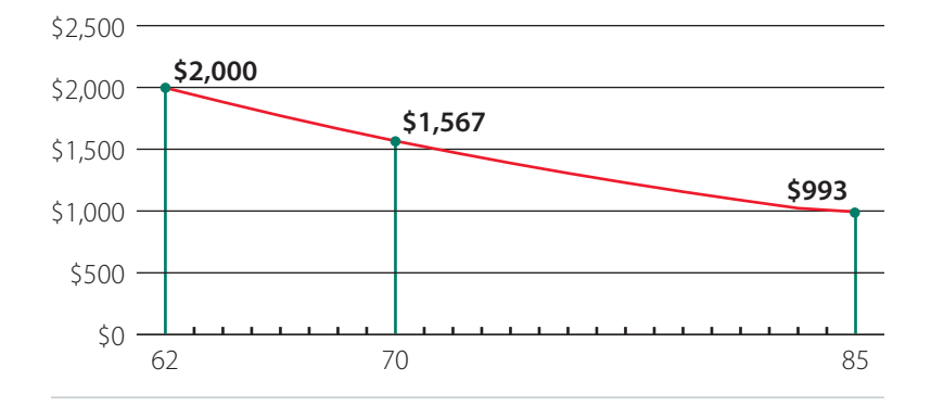
Figure 2. The Effect of 3% Inflation on a $2,000 Benefit

For example, let's say that a woman retires at age 62, with a benefit of $2,000 per month. And let's say that inflation averages about 3% per year after she retires. Figure 2 below shows the impact that this 3% annual inflation rate has on her purchasing power.